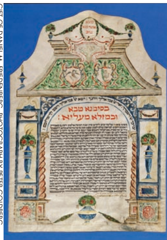
Ketubbah (marriage contract), Ferrara, Italy, 1825.