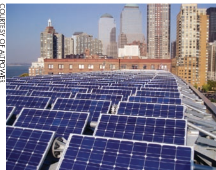
Solar panels on the roof of the Museum.

When the Robert M. Morgenthau Wing was being planned in 2000, solar panels were rarely seen in New York City architectural plans for commercial spaces. But in an attempt to lead by example, the Museum made the decision to install 330 solar panels that continue to help power the building today. In the news, reports of the fragile state of our ecosystem are appearing with increasing frequency. The Museum